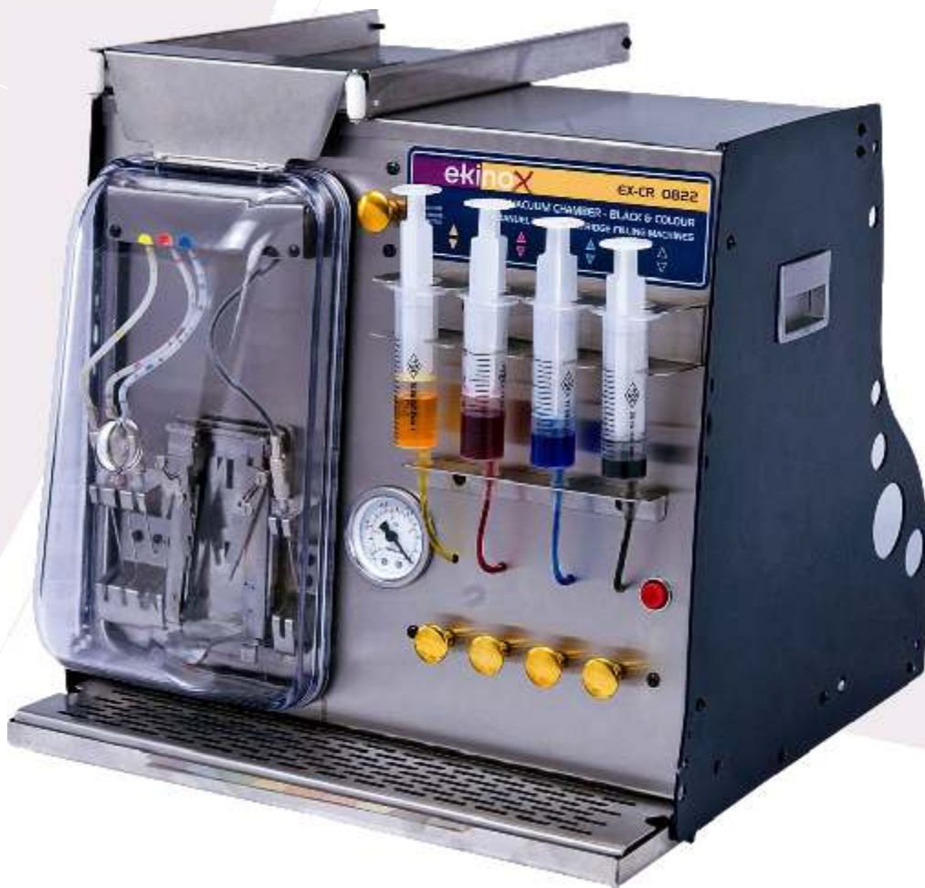
Manual vacuum chamber filling